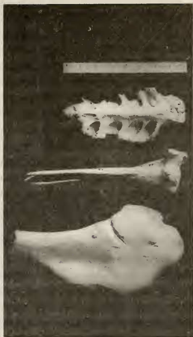
Fig. 3. Some of the bone finds of great bustard ( Otis tarda ) from Yassa-Tepe (1st millennium B.C.). Top to bottom: axial fragment of pelvis; proximal part of tibiotarsus; proximal end of humerus.